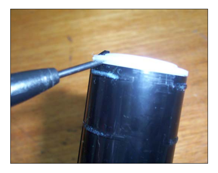
6. Remove the carrier fill plug.

5. Now pull the cap, out away from the cartridge.