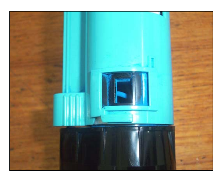
4. Turn the cap until the tab comes to a complete stop and has entered under the blue cap.